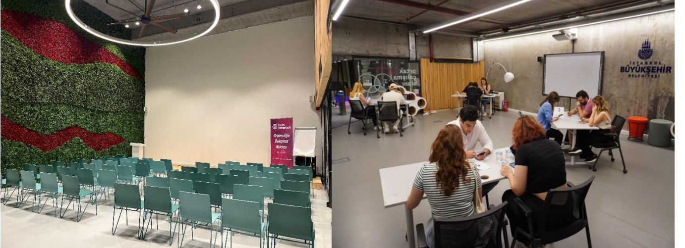
Tech Istanbul | Şişhane meeting rooms

Tech Istanbul operates under the İstanbul Metropolitan Municipality Department of Information Technologies, helping startups grow fast and build scalable business models with its entrepreneurship programs.