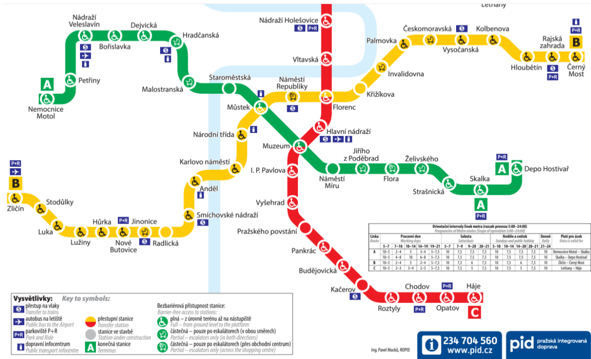
Map of the Prague metro network.