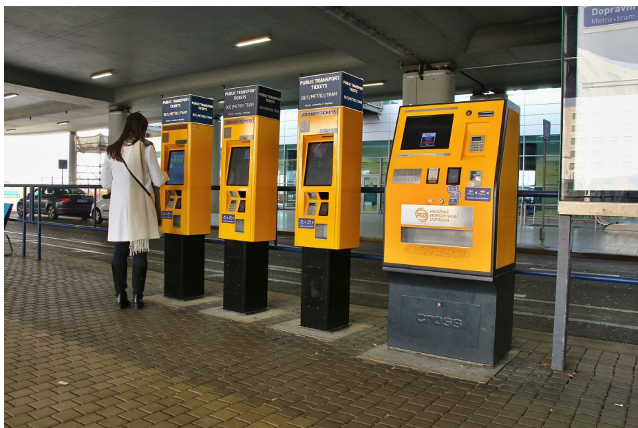
Photos of Ticket machines at Terminal 2 Prague Airport Arrival

Tickets for public transport can be bought in machines at the airport, in the subway or train (see photo), in newsstands or on selected tram and bus routes. I would like to point out that in trams it is only possible to buy a ticket with a credit card and in buses only in cash in CZK with the bus driver. For more detail https://pid.cz/en/tickets-and-fare/how-to-buy-ticket/