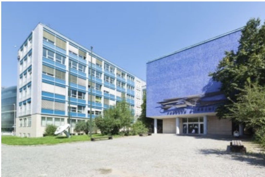
FME CTU Main Entrance Photo